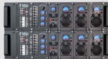
B17-3F Two Stack

Our inverter/charger and MPPT solar and wind modules are hot swappable and available in various voltage configurations.