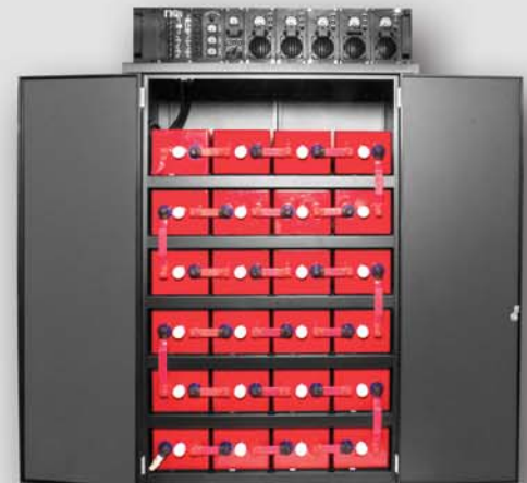
MNB17-5 & Battery Box