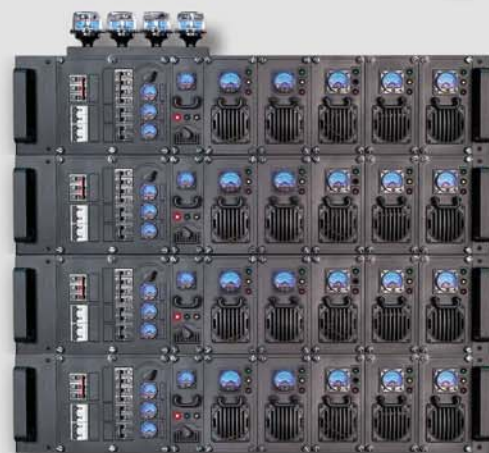
B17-5F Four Stack