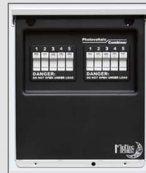
MNPV12 Configured for 600VDC Fuses (Gridtie)