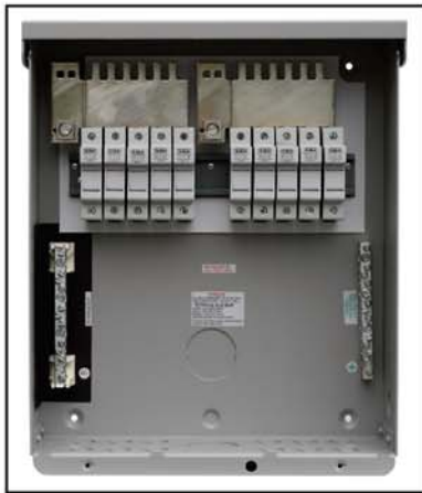
MNPV12 Configured for 600VDC fuses (Gridtie)

NOTE: All of the connections have a 90 deg C rating except the 2/0 positive lug that carries a 70 deg C rating. MidNite can supply 1/0 lugs to substitute in these cases where 90 deg C is required.