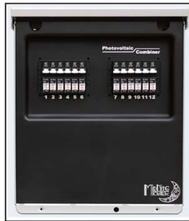
MNPV12 Configured for 150VDC breakers (Gridtie)