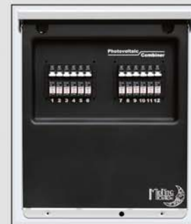
MNPV12-250 Configured for 150VDC breakers