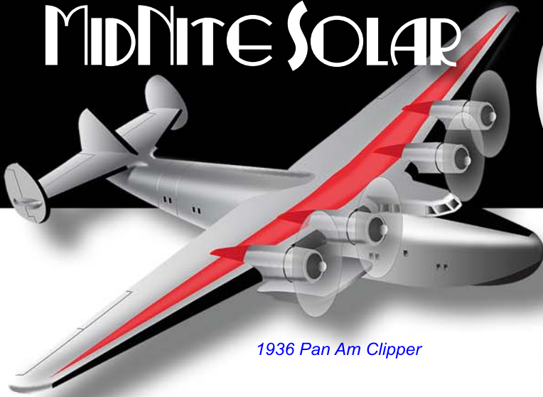
1936 Pan Am Clipper