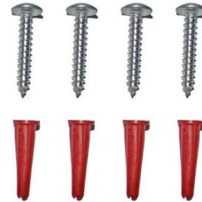
Parts included with the MNSPD Kit Surge suppressor sold separately

You will need a Phillips screwdriver, a slotted screwdriver and hammer for removing knockouts, a small saw to cut an opening in the wall, and a pilot drill for the wall anchors. Wire nuts may also be required.