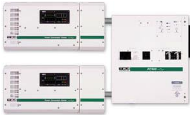
Connect Energy PC500