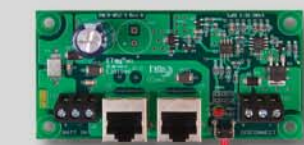
Battery Disconnect Module (MNBDM)

MNEDC125RT, MNEDC175RT, MNEDC250RT, MNDC-GFP100RT-2P, MNEPV16-600RT and MNEPV20-600RT Breakers