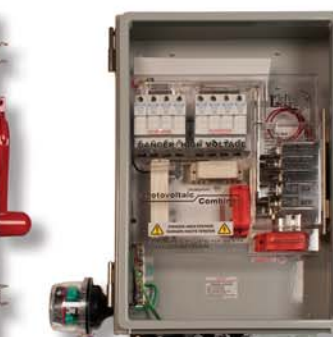
MNPVHV8 3R not shown