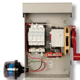
MNPVHV4 Basic 3R not shown