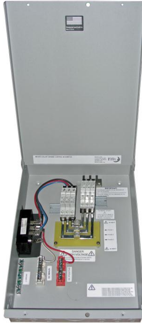
MNTCB Turbine Control Box

The MNTCB Turbine Control Box is designed for use with three phase turbines.